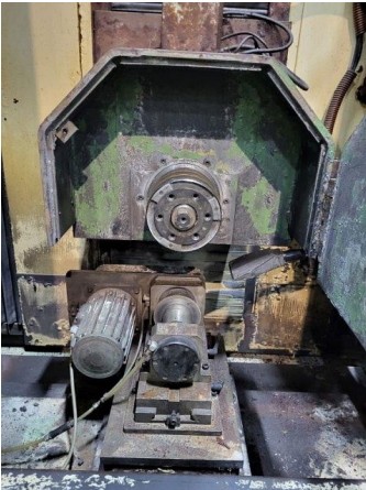
Grinding Disc Housing Open