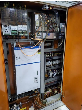
E Cabinet Inside