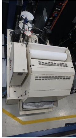
Tank inkl. Filter