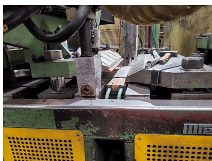
Band Stoss schweißen