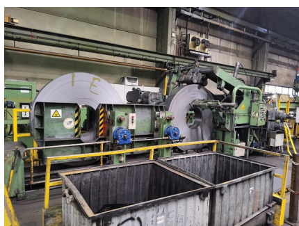
Bandanlage Übersicht 2