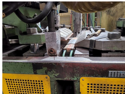
Band Stoss schweißen