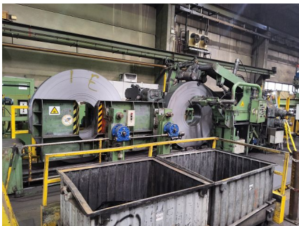
Bandanlage Übersicht 2