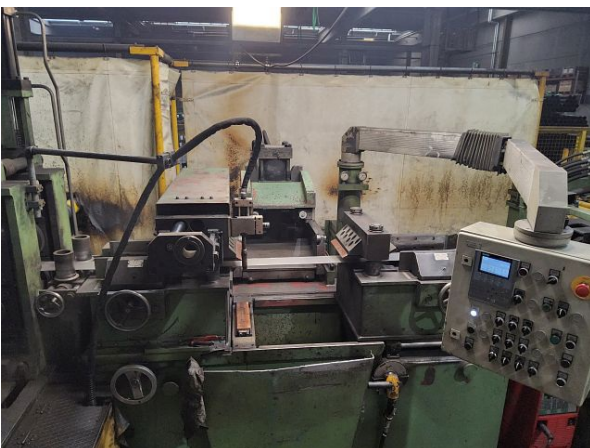
Band Stoss schweissen