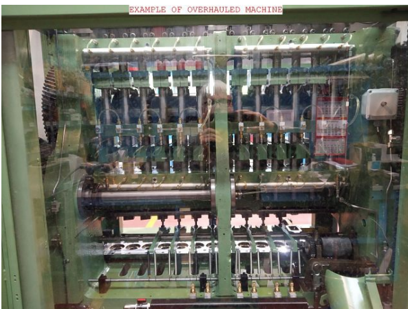
Tool area back