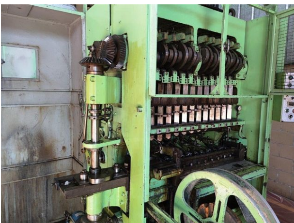
Side shaft and front