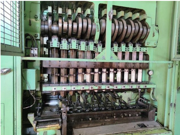
tool and cams