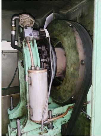
Clutch and flywheel